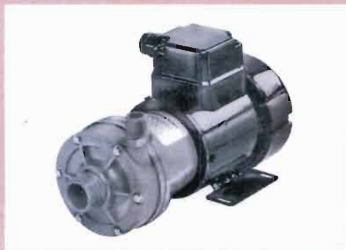
Magnetic coupled sealless pump 'MDR'