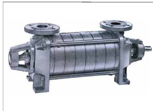
Multistage Pump - Type MCH