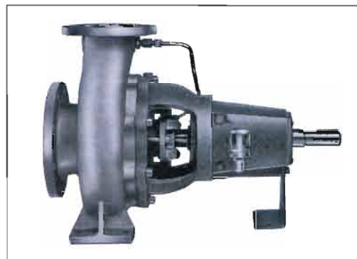
Back Pullout Pump - Type CN/CCR