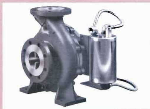
Self priming pump 'CH'