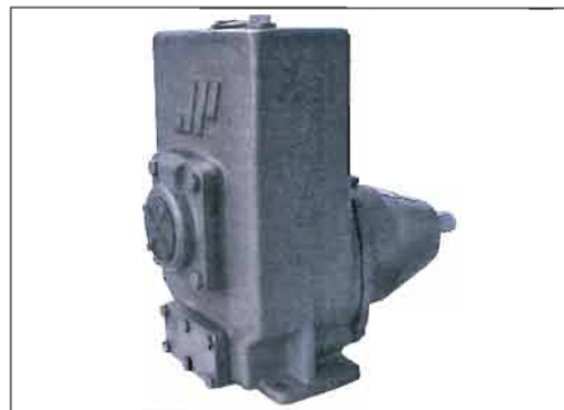
Self Priming Pump Type - KGEN/C

The thermic fluid pumps are supplied in CS or NCI construction. Pumps are offered with graphoil packing or optionally with mechanical seal. Most suitable for high temperature applications to handle Hitherm 500, Dowtherm, etc. The back pullout design reduces maintenance down time.