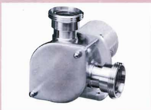
Flexible impeller pump 'FIP'

In addition to customers in India these high quality, low maintenance pumps are also regularly exported to European countries.