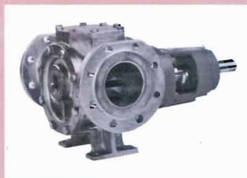
Internal rotary gear pump 'SRT'